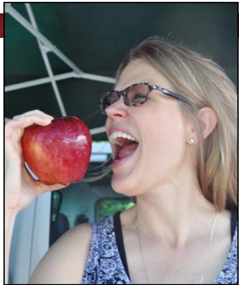
At a farmer's market – this apple was so big!